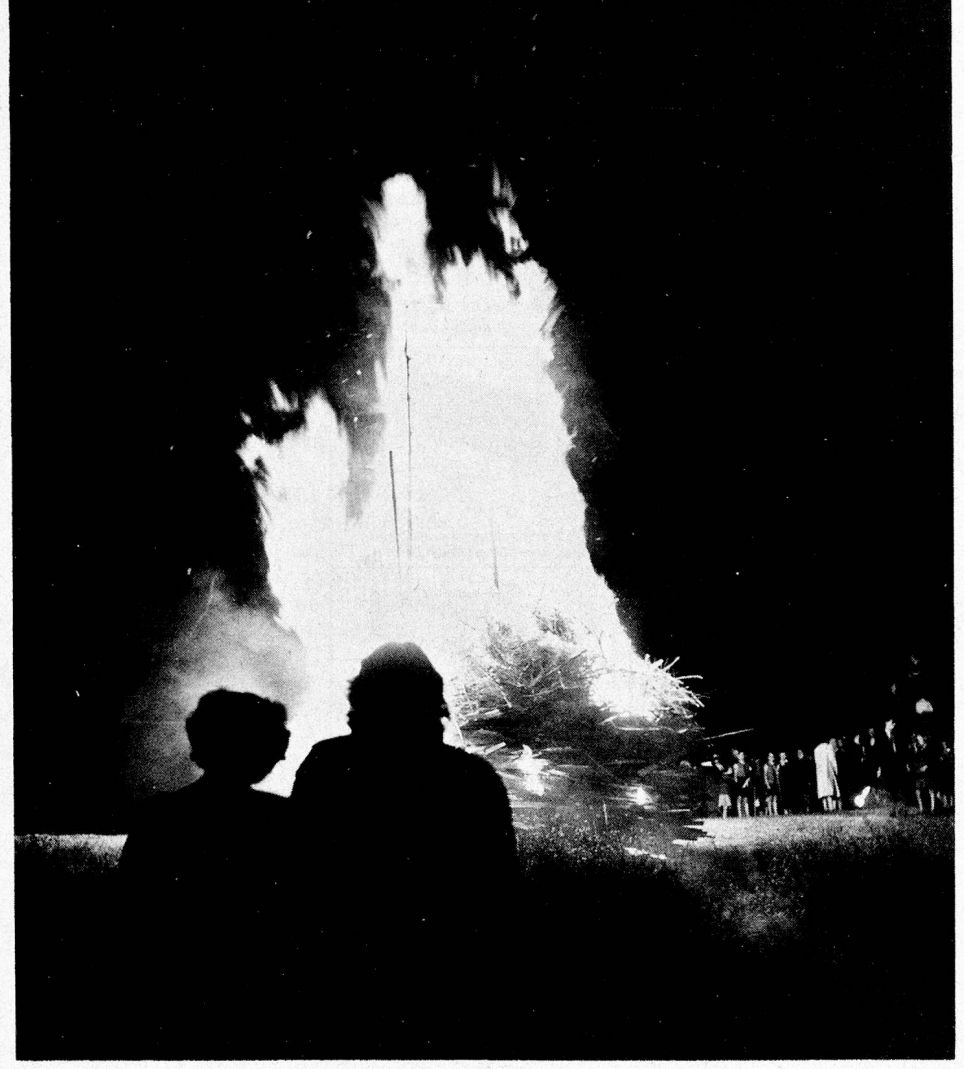
The lighting of bonfires as night falls is one of the ceremonies attached to our National Day.

One early August day in 1291 men from the valley communities of Uri, Schwyz and Unterwalden met and swore to help one another in warding off attacks and thwarting injustice. The pact written in Latin and sealed - is still preserved in the Swiss archives at Schwyz. Since 1st August, 1891, the 600th anniversary of this event — the birth of the Swiss Confederation - has been a day of national celebration, though until a few years ago the ceremonies were confined to the evening hours. As night fell church bells rang out through the land and the people of town and city assembled in school grounds and, by the light of bengal flares listened to brass bands, watched the local gymnasts build human pyramids and paid attention to solemn addresses by a representative of the local government. And then, at about 10 pm, the party broke up and each and everyone went his own way to finish the