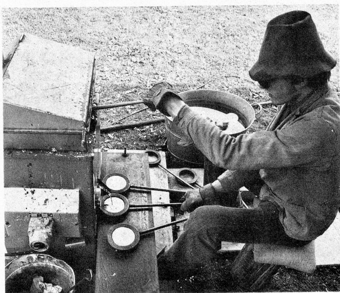
Pouring lead for the targets