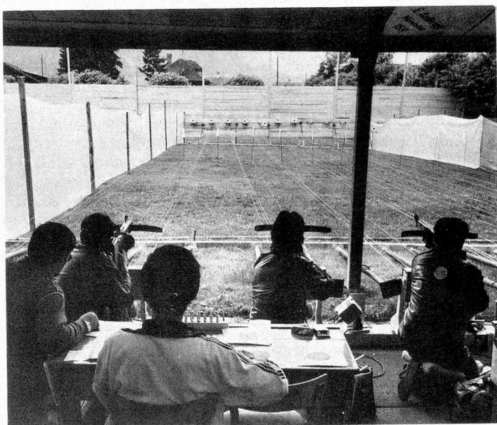
Sidescreens of plastic or fabric are used to reduce wind effects.