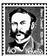
Henri Dunant 1828-1910 Philanthrop Philanthrope Filantropo