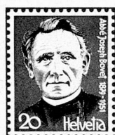
Abbé Joseph Bovet 1879-1951 Komponist Compositeur Musicista

Ausgabetag Jour d'émission 14 9 1978 Giorno d'emissione