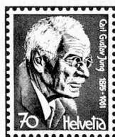
Carl Gustav Jung 1875-1961 Psychologe Psychologue Psicologo