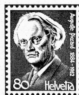
Auguste Piccard 1884-1962 Physiker Physicien Fisico