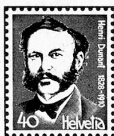
Henri Dunant 1828-1910 Philanthrop Philantrophe Filantropo