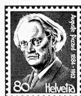
Auguste Piccard 1884-1962 Physiker Physicien Fisico