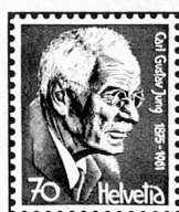
Carl Gustav Jung 1875-1961 Psychologe Psychologue Psicologo