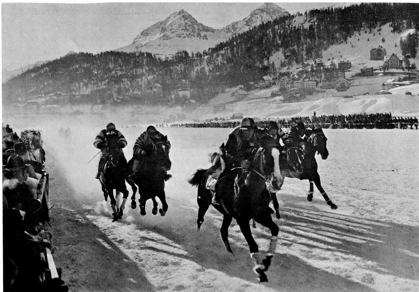
International Horse Races on the frozen lake of St. Moritz