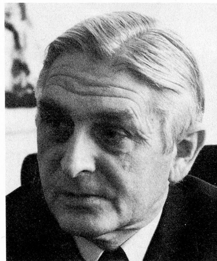
The former Federal Councillor Ernst Brugger, President of the Commission since 1979