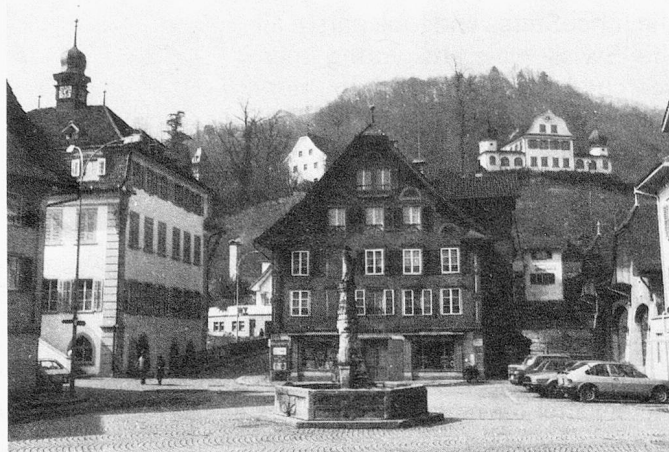
A square in the old Sarnen; on the left the town hall; the old shooting stand on the Landenberg hill (Photo Rheinhard).