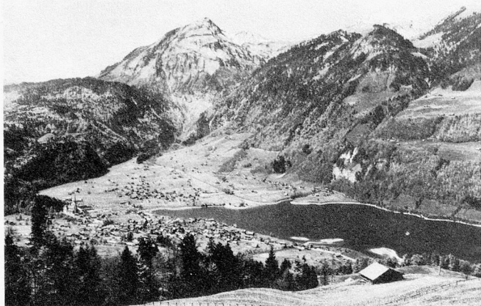
Lungern and its lake