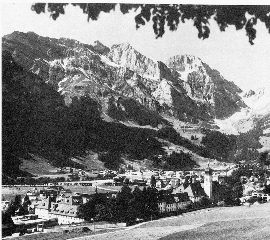
The Benedictine Abbey of Engelberg, founded in 1120 (Photo ONST).