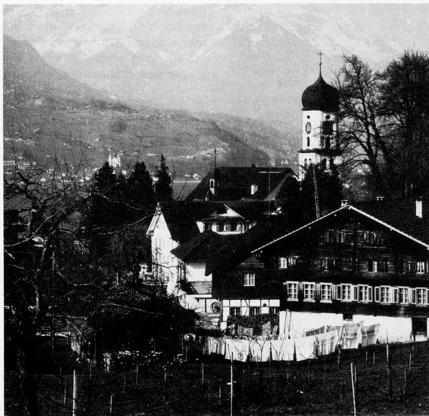
View of Sachseln and the lake of Sarnen

sions of his youth spent at Sachseln, the impressive landscape around the Sarnersee and the people he knew – a beautiful and warm-hearted picture. Yodeling and Betruf have always been part of musical life, and folk music is widely cultivated. Many Obwalden writers, composers of popular and modern music, painters and sculptors are known well beyond the boundaries of the Canton. Such culture needs great care, just like the countryside, for the two are intertwined. There exists earnest endeavour to protect and enrich the landscape: protection by segregating building land from open meadows and woods, and by re-introducing the lynx.