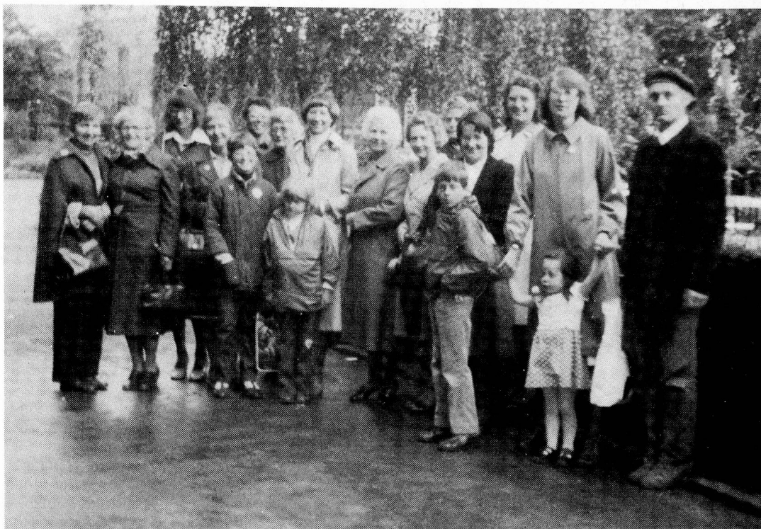
Damp but not dispirited at Bristol Zoo

costumes of Evolène in the Val d'Hérens sang with grace and charm and most efficiently and were enthusiastically applauded by the large audience.