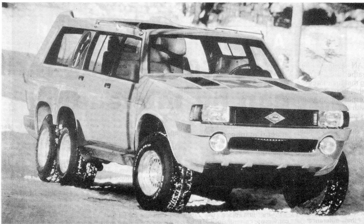
King Khaled's Windhawk complete with royal crest