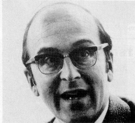
Justice Minister Mr Kurt Furgler is the new Swiss President

usually remain in office until they say they want to resign.