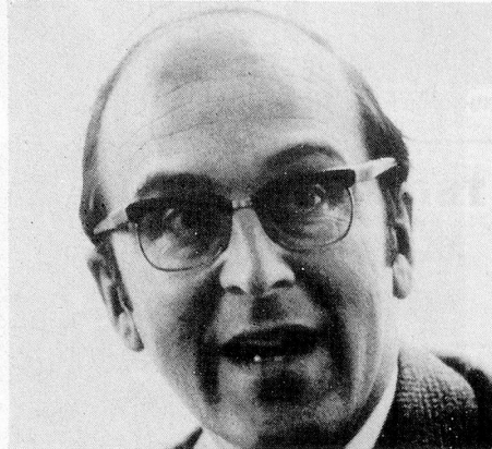
Justice Minister Mr Kurt Furgler is the new Swiss President

usually remain in office until they say they want to resign.