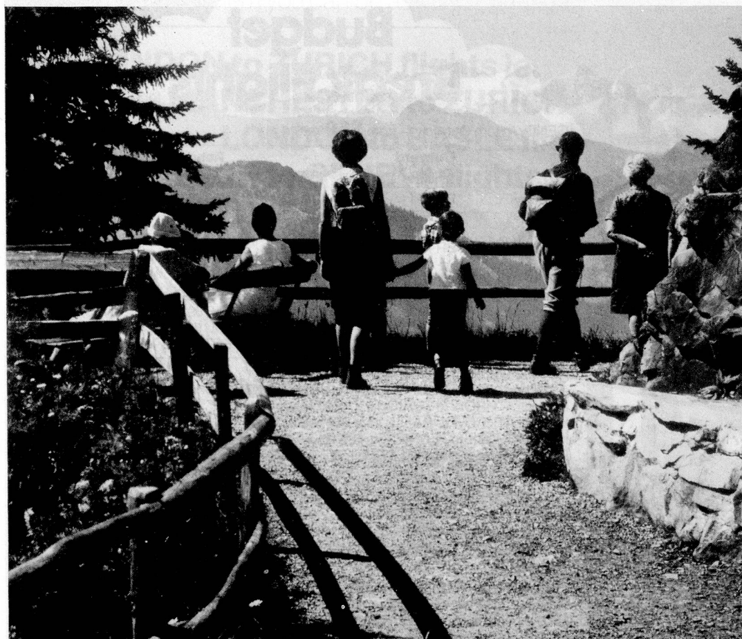
Hikers on the crest trail of the Stanserhorn

BRITISH tourists are re-discovering Switzerland!