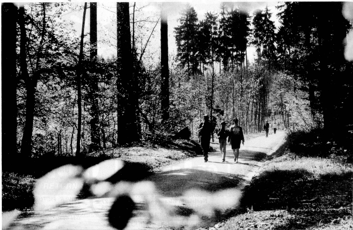
On the Uetliberg above Zurich