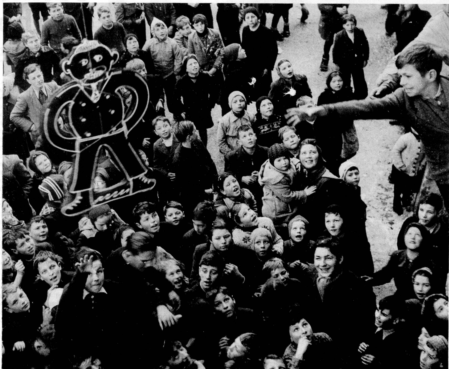
The highlight comes when the children pull a gingerbread man to pieces

Compiled by the Swiss National Tourist Office