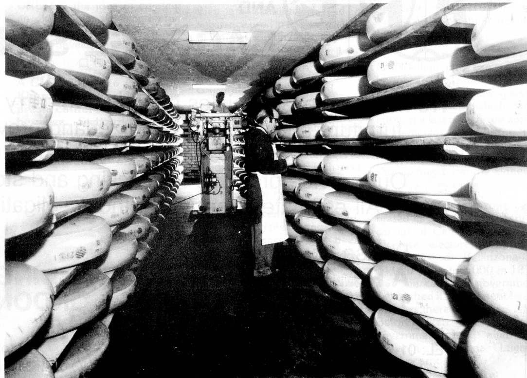
Cheese-makers make their daily rounds in the storage cellars to check the loaves