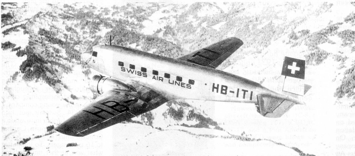
The Douglas DC-2 which inaugurated the service between Switzerland and London in 1935. It only carried 14 passengers, yet 6,325 flew the route in its first year.

In conclusion I should like to thank all our friends in the Swiss community in our region for their loyal support. Without it we would not now face the future with the same degree of confidence.