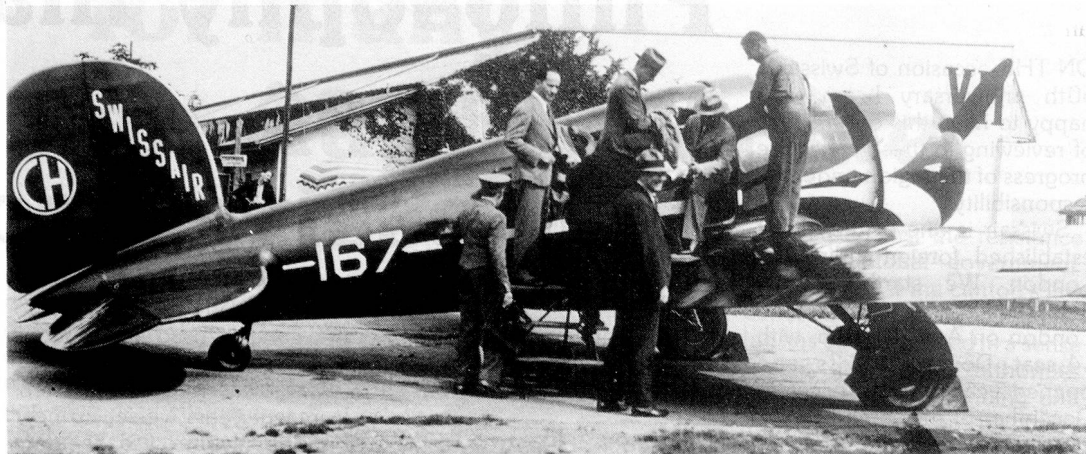
Loading a Lockheed-Orion in 1932. It carried four passengers plus the pilot.