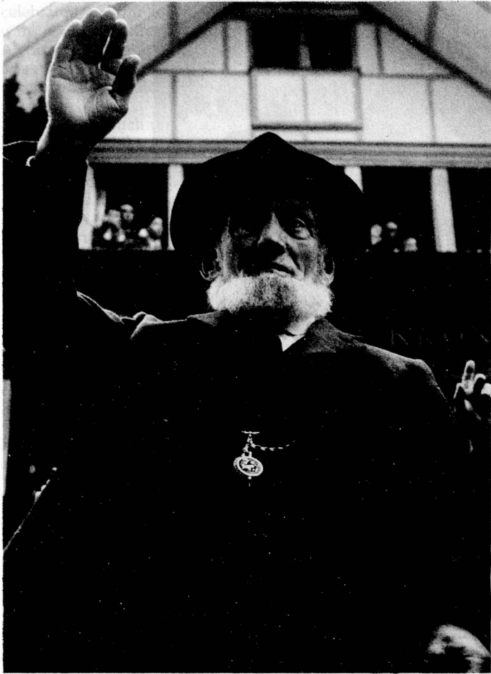
In the canton of Appenzell the sword symbolises the citizen's right to vote