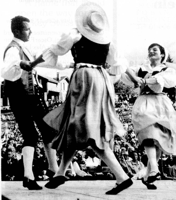
Folk dancers abound. These are from Geneva