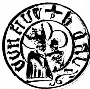
The seal used by Nikolaus von der Flüe

His military and political life was very active and successful and in great contrast to many of his colleagues since he abhorred intrigue and was held in greatest respect for his unbribable sense of justice and integrity. This caused him many a hidden enemy.