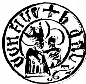
The seal used by Nikolaus von der Flüe

His military and political life was very active and successful and in great contrast to many of his colleagues since he abhorred intrigue and was held in greatest respect for his unbribable sense of justice and integrity. This caused him many a hidden enemy.