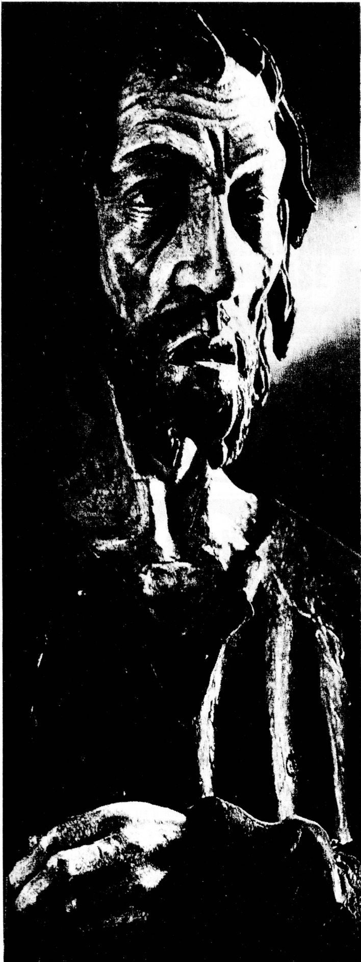
A friendly man "of high stature with wild hair ... and bright intelligent eyes"

AT the age of 50 Nikolaus von Flüe stood before the ruins of his entire career.