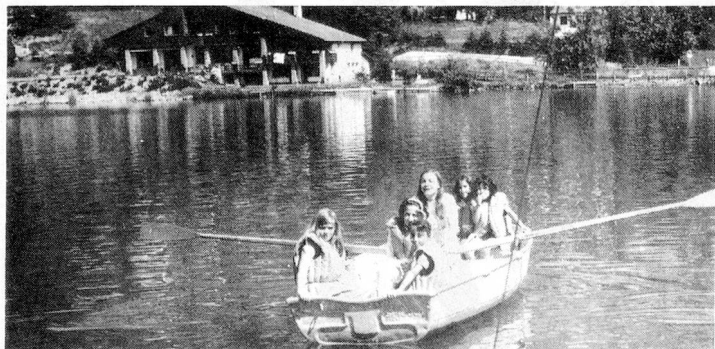
Swiss schools provide an opportunity for tourism

provide a general education along with vocational training.