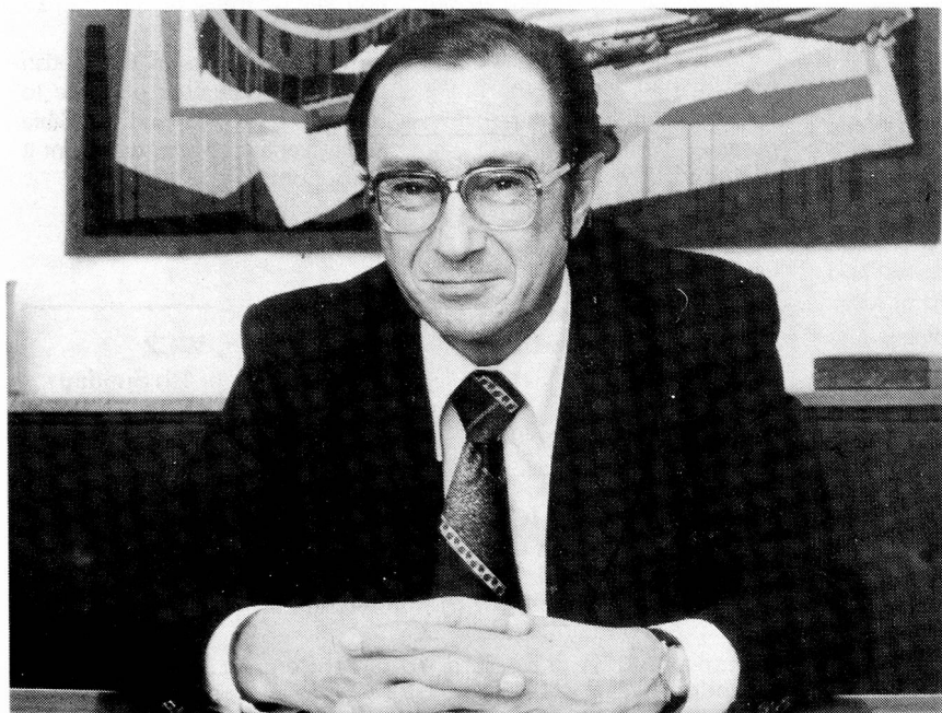
Pierre Aubert . . . much-travelled advocate of a more open foreign policy

In the cabinet he supports an opening of Switzerland's foreign policy, and he has made trips to several developing countries in Africa. There was some public criticism of his travelling, but in Switzerland the seven members of the government are jointly responsible for such trips as well as for any other government activity.