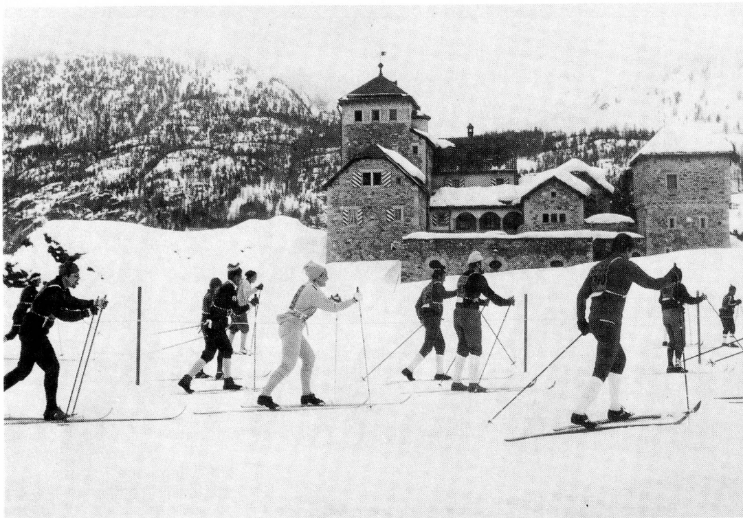
Some of the skiers in the 35-mile marathon near the Castle Crap da Sass in Silvaplana/Grisons.