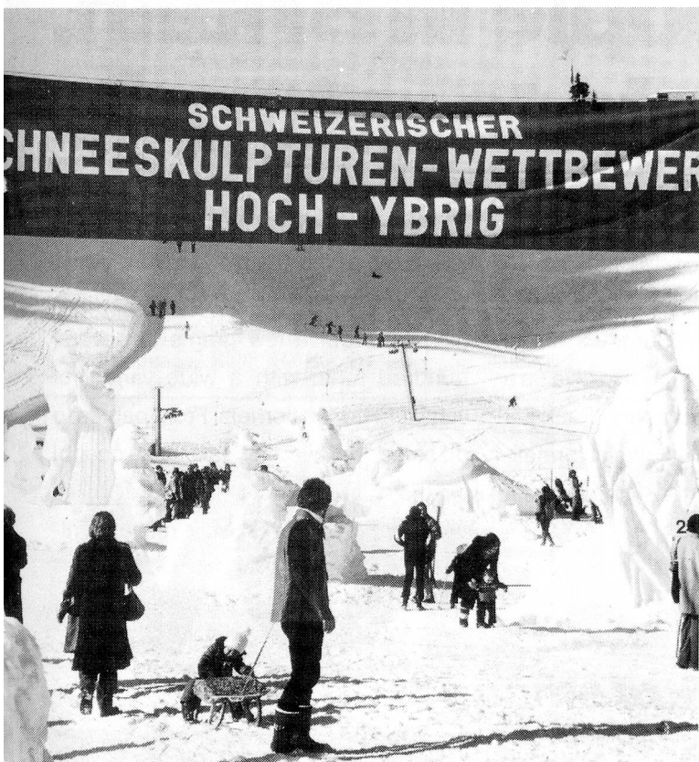
Amateurs and professionals compete in this annual contest in Central Switzerland.