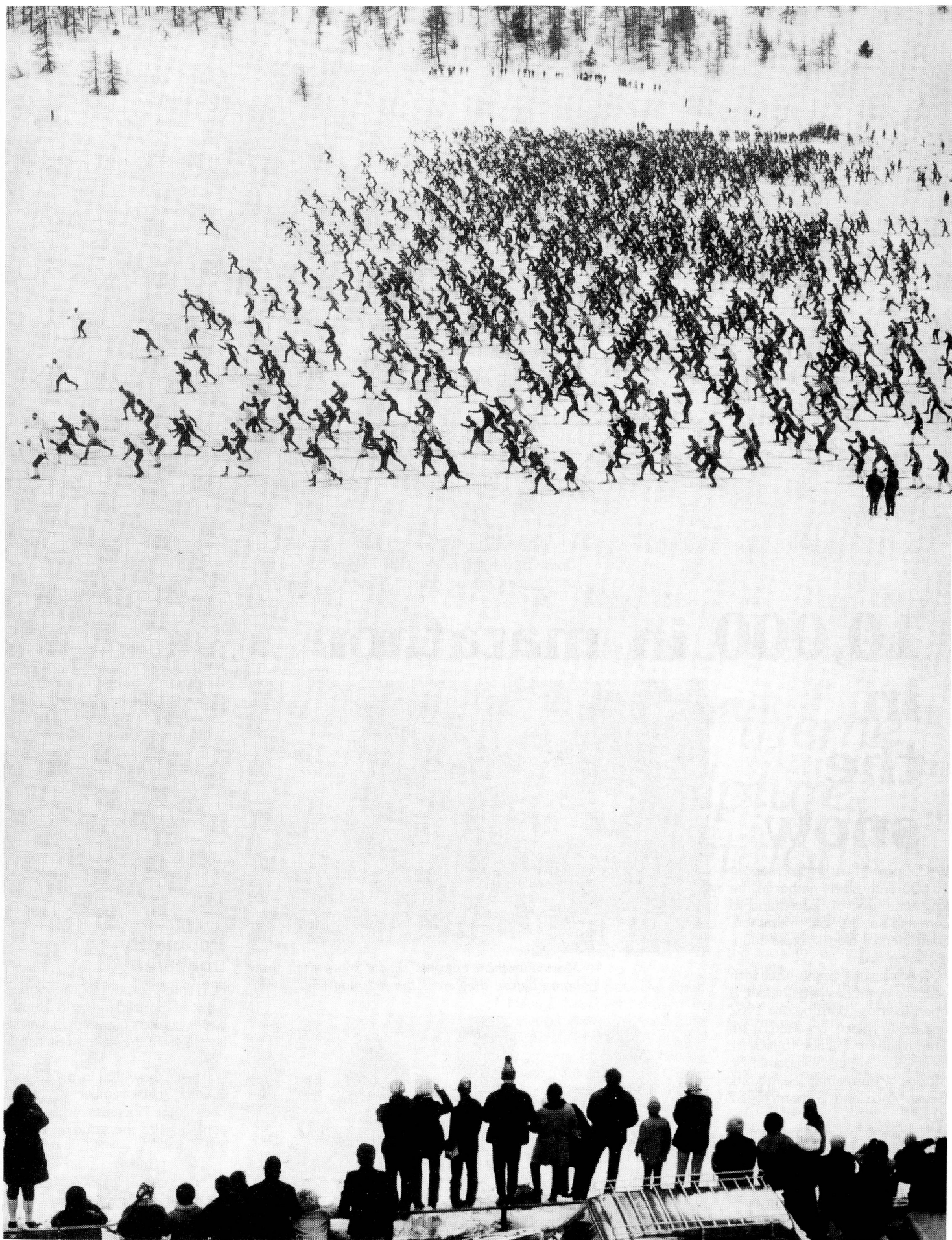
The first of the 10,000 entrants in the Engadine Ski Marathon pull away from the start. More pictures overleaf.