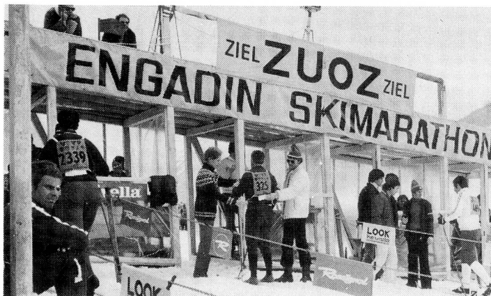
Most marathon entrants ski for more than three hours before they cross the finishing line.

An all-inclusive arrangement from March 7 to 15 (eight nights), combining scheduled air travel to Basle, rail transfer, half board at the two-star Hotel Scaletta at S-chanf near Zuoz, tuition and training, as well as the entry fee for the marathon, is available from £245.