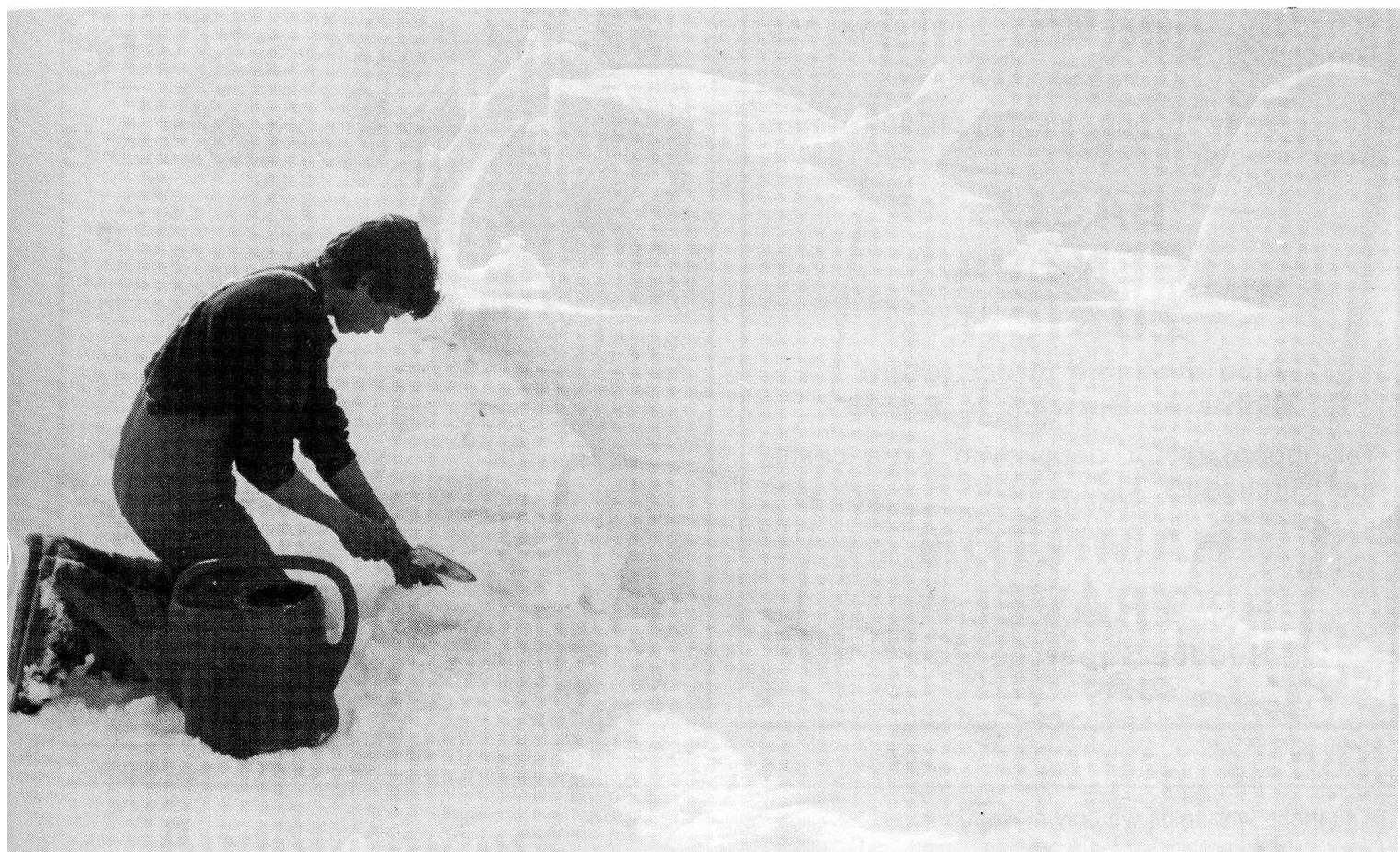
ry in the snow at one of Hoch-Ybrig's past competitions.