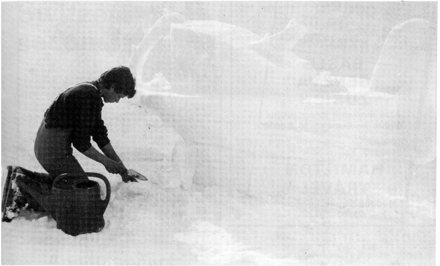
ry in the snow at one of Hoch-Ybrig's past competitions.