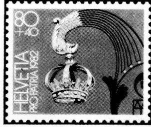
Picturesque inn signs depicted on the latest "Pro Patria" stamps