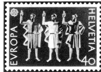
Echoes of 1291: this year's "Europa" stamps