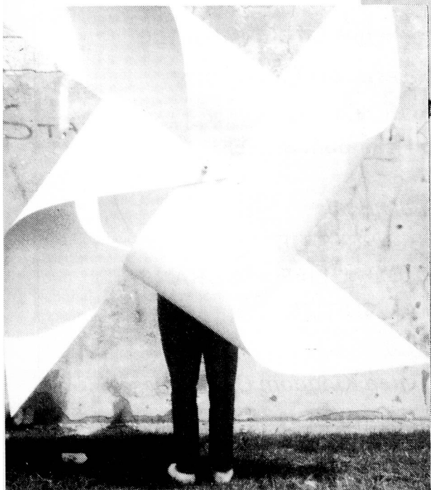
This plywood propeller by Pierre Degen is worn with the aid of a harness. Degen's work will be on show from September 22 to October 24 at the Craft Council's Gallery in London.