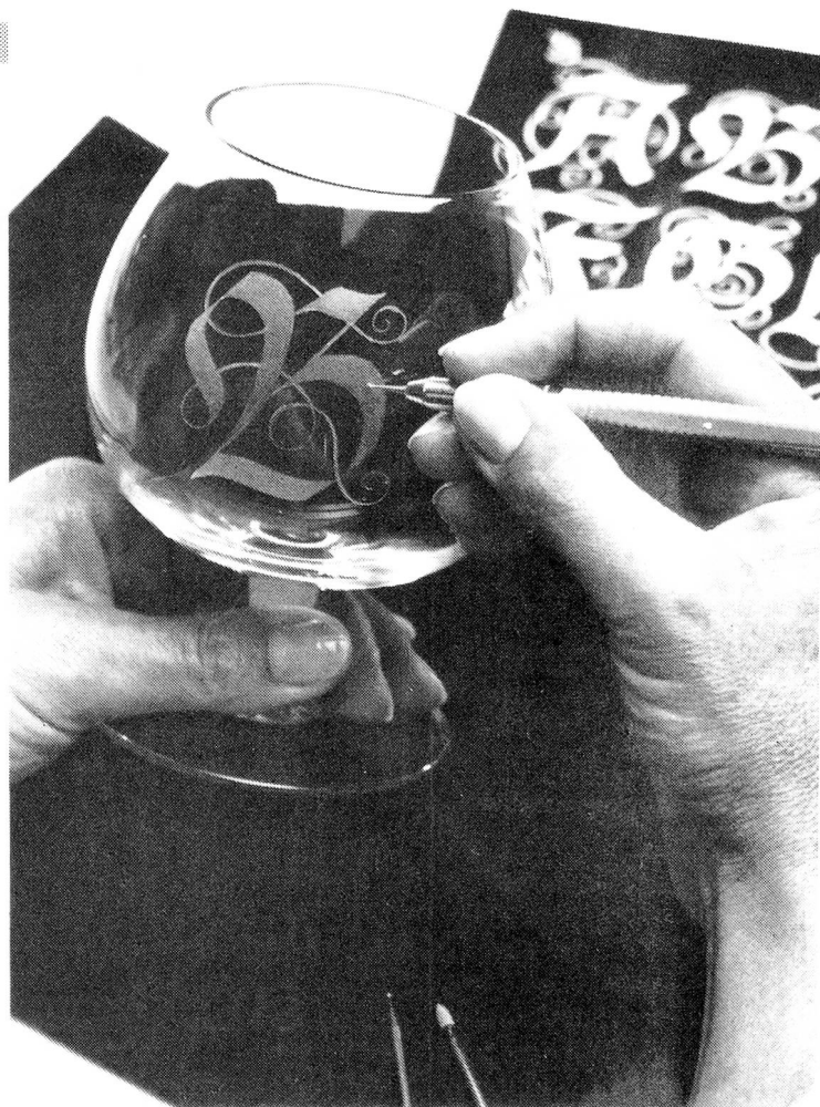
The delicate art of etching on glass

GLASS engraving, once the privilege of a few masters, can today be practised by people of every age and profession, even without any artistic talent or experience, thanks to a surprising new and easy technique developed in Switzerland by a group of enthusiasts some years ago.