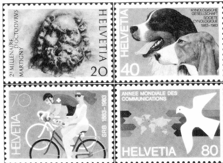
THE Swiss Post Office issued new postage stamps on August 22.