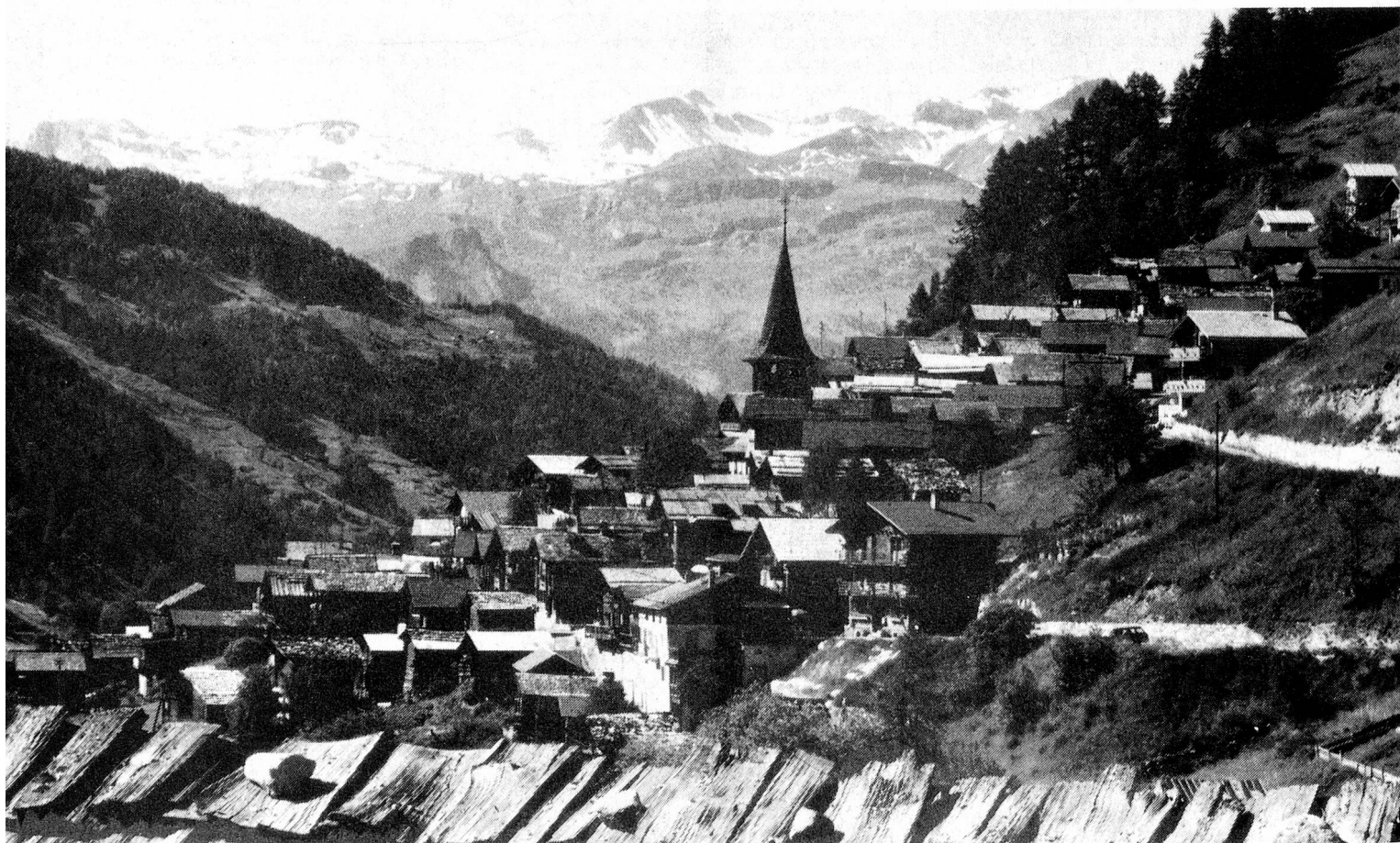
Weather-beaten houses surround the church at Ayer

But change has come as roads have been opened and good communication established with such centres as Sierre. This is the town where one is told they cease to speak French and begin to speak German.