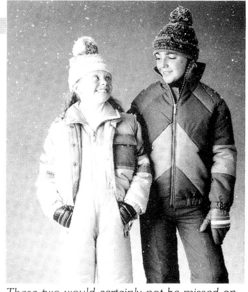
These two would certainly not be missed on the slopes. The girl's outfit is a snug all-inone with matching gilet, and the boy's is a chevron stripe jacket with matching salopettes.