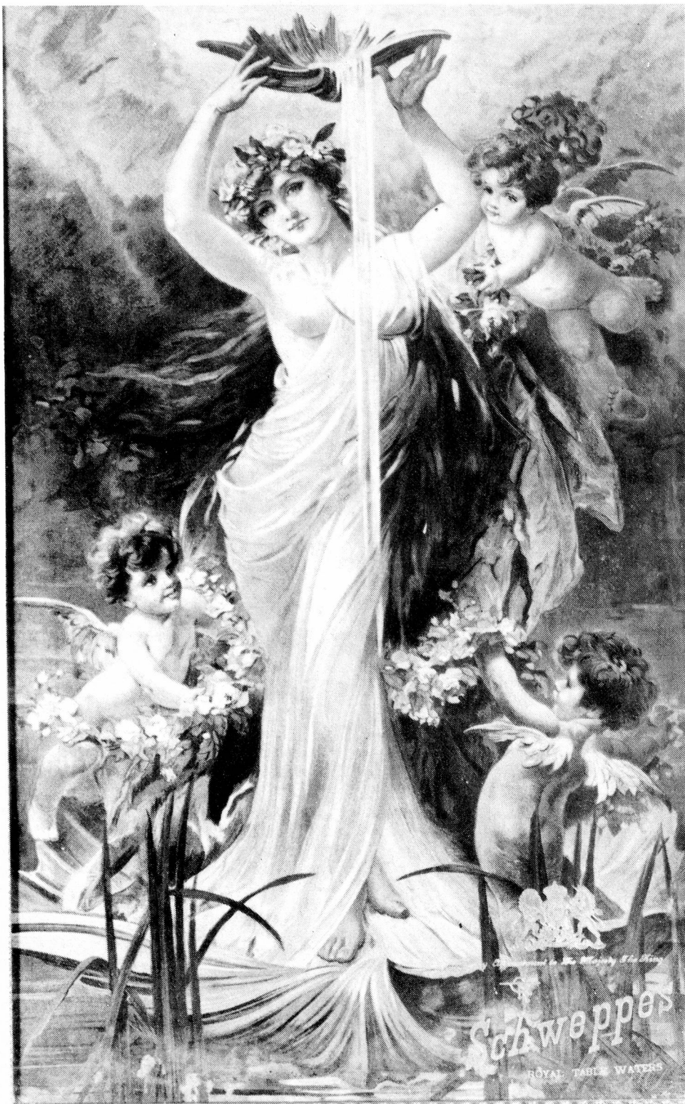
This advertisement for Schweppes "Royal Table Waters" about 1900 captures the essence of the turn-of-the century ideal of feminine beauty