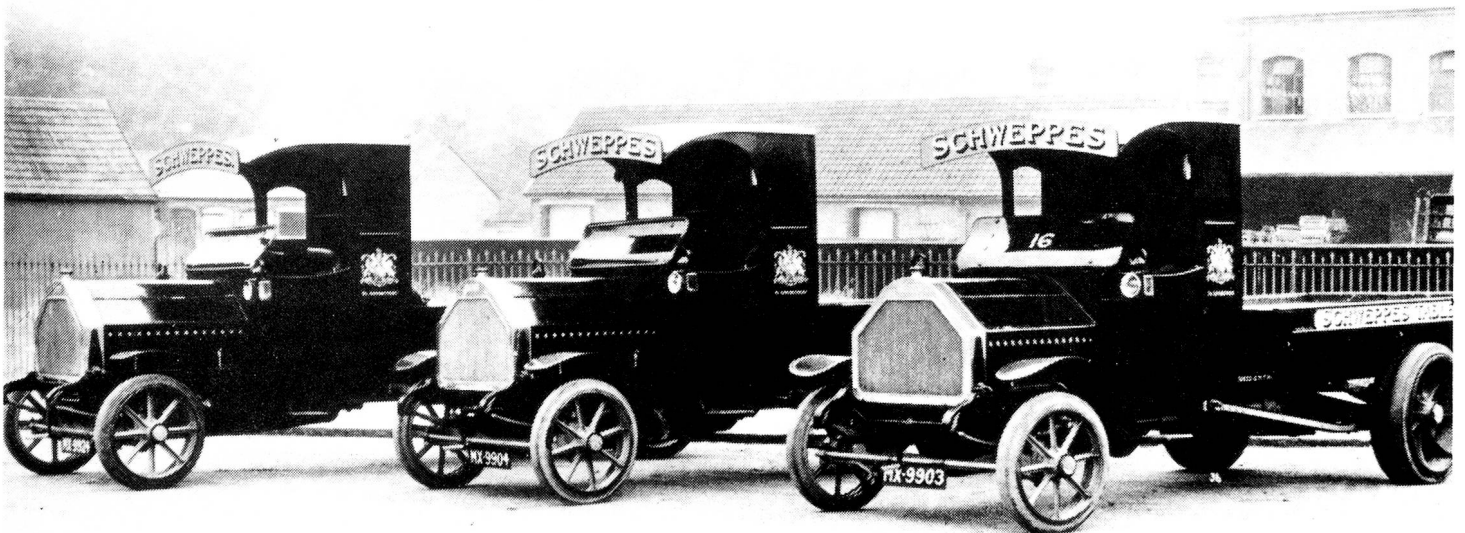
A Schweppes fleet of Swiss "Berna" trucks in London, 1915