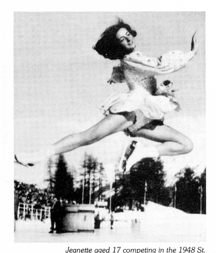
Moritz Olympics where she won the bronze for Britain . . .

WHEN the Winter Olympics are staged in the Yugoslav resort of Sarajevo this month, the thrills and spills will be watched by a worldwide television audience of millions. One of the most fervent followers will be a British-born housewife in Berne, for whom the 1984 Games will revive many personal memories of Olympic tears and triumph.