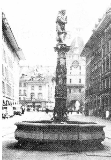
The bagpipes player