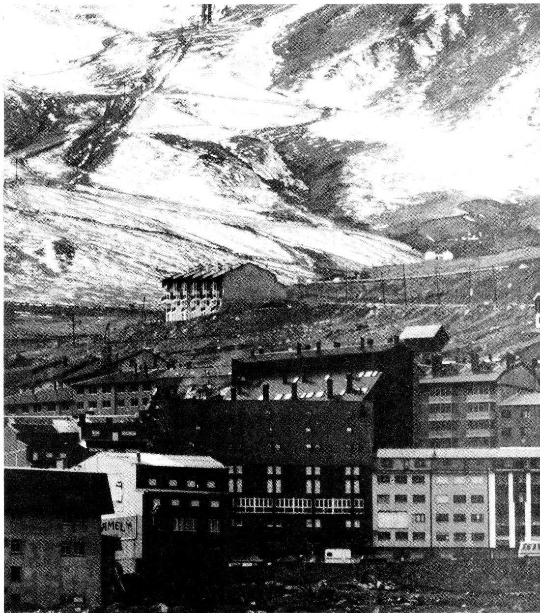
Swiss planning will help Andorra avoid this kind of unattractive development

cantons have brought their guidelines for encouraging tourism into line with the proposals of the overall concept.