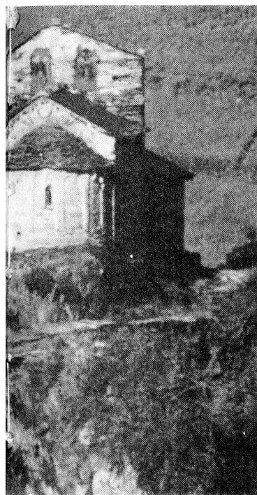
...by attraction for tourists