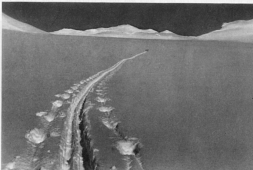
Traces left by the first skiers on the Ebnefluh, near the Jungfrauoch