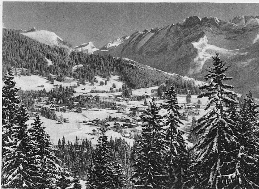
An den sonnigen Hängen von Villars sur Ollon Les pentes ensoleil- lées de Villars sur Ollon