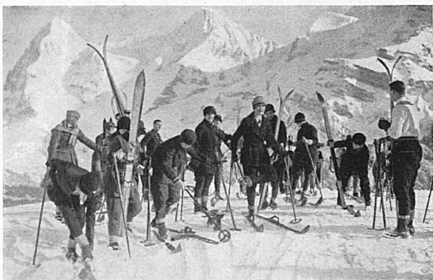
In the Bernese Oberland / Im Berner Oberland