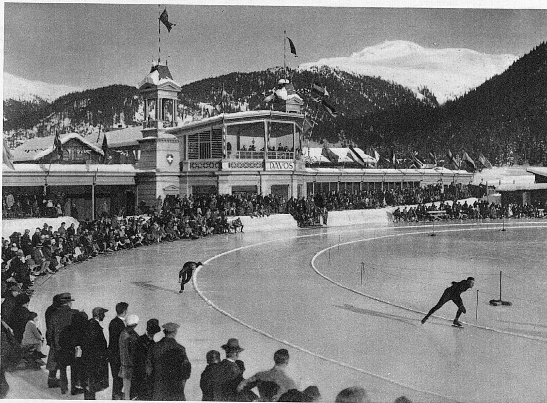
Schnellauf und Hockeysturnier auf dem Davoser Eise / Course de vitesse et match de hockey sur les patinoires de Davos A Skating Race and a Hockey Match on the Rink at Davos / Pattinaggio e gare di Hockey sul ghiaccio a Davos