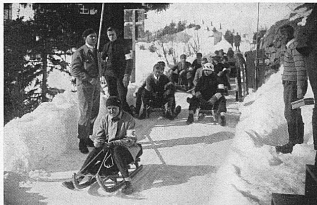
On the Schatzalp near Davos / Auf der Schatzalp bei Davos