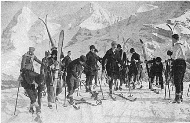
In the Bernese Oberland / Im Berner Oberland