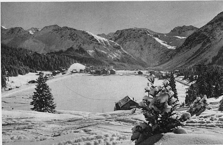
Arosa, with its girdle of glorious mountains