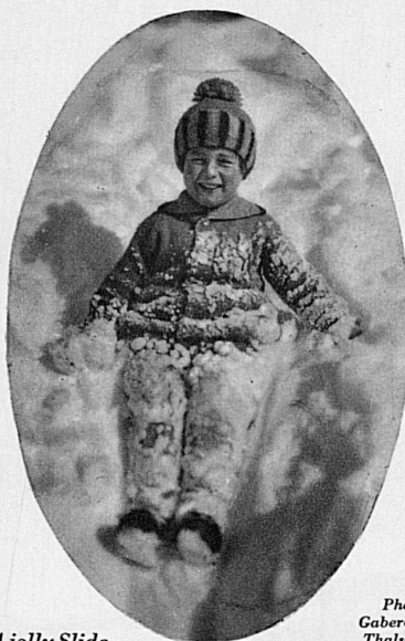
A jolly Slide