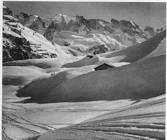
Das Eldorado der Skiläufer bei Mürren Le paradis du skieur aux environs de Mürren The Skiers' Paradise, Mürren L'Eldorado degli skiatori presso Mürren