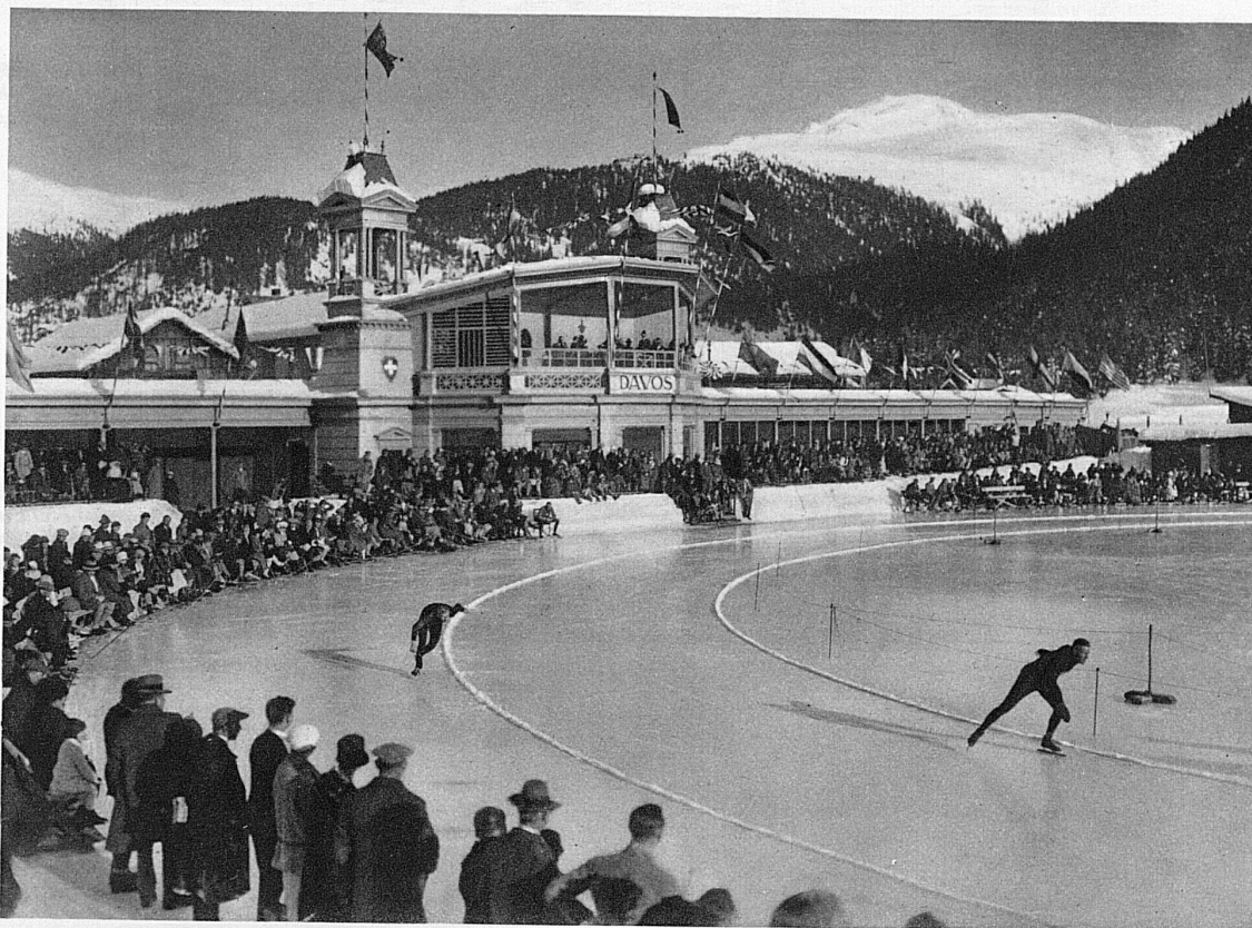
Schnellauf und Hockeyspiel auf dem Davoser Eise / Course de vitesse et match de hockey sur les patinoires de Davos A Skating Race and a Hockey Match on the Rink at Davos / Pattinaggio e gare di Hockey sul ghiaccio a Davos