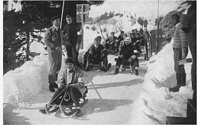
On the Schatzalp near Davos / Auf der Schatzalp bei Davos