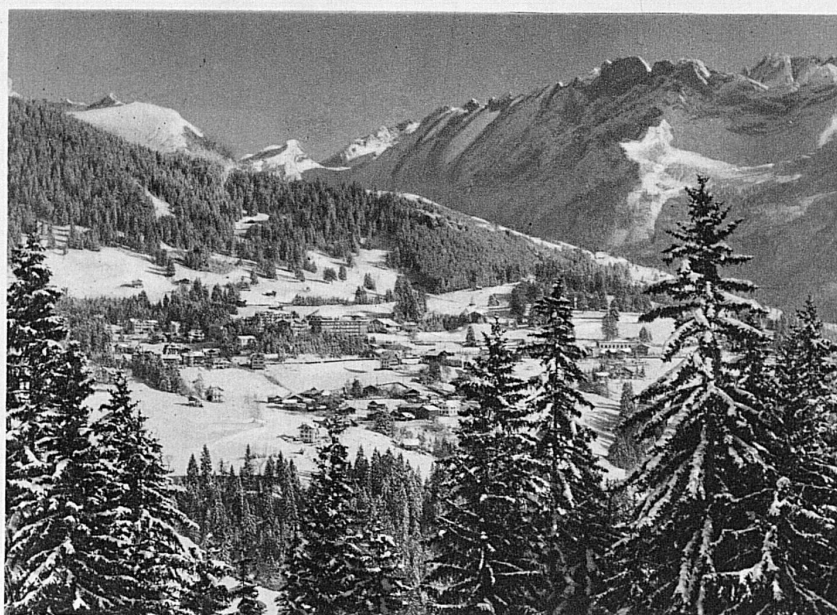
An den sonnigen Hängen von Villars sur Ollon