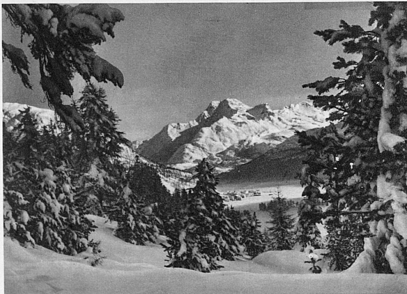
In den Schneegefil- den des Appenzeller- landes L'Appenzell sous la neige Appenzell under Snow Nevai appenzellesi