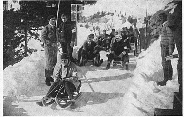
On the Schatzalp near Davos / Auf der Schatzalp bei Davos