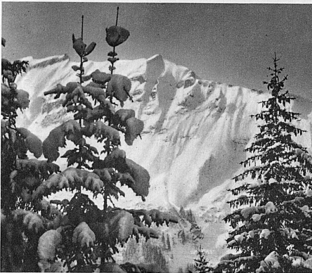
Schneeglitzernde Pracht bei Wengen Splendeur de la montagne près de Wengen sous le scin- tillement de la neige Mountains in their winterglory, op- posite Wengen Magnifico luccichio della neve presso Wengen