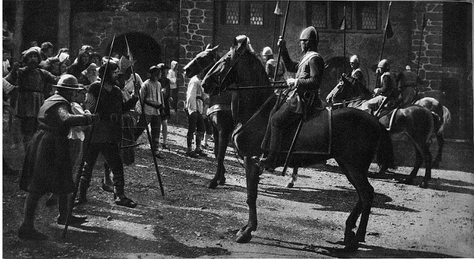
The steel clad knights of Gessler prevent the unarmed peasantry from rescuing Tell from the Governor, to save him from shooting at the apple