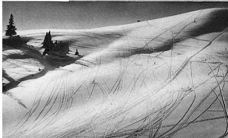
Left: The Hugeligrat near Gstaad has a par- ticularly good repu- tation in Ski-ing circles