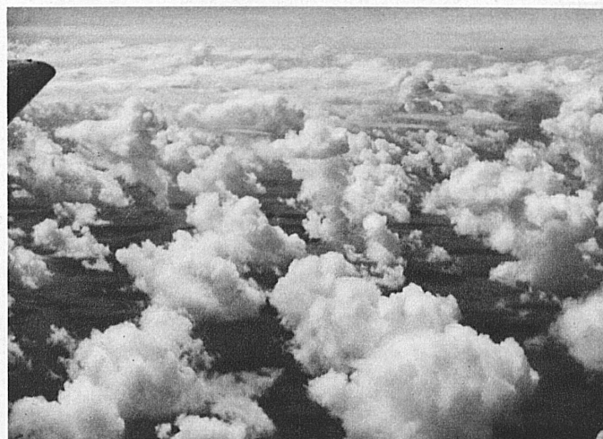
A huge sea of cloud covers the Continent, piercing it, the plane emerges into clear sunshine

Small wonder that visitors to Switzerland are becoming more and more air-minded. They eliminate the long train journey at night and the Channel crossing, thus gaining almost a whole day. The advantage of this need not be commented on, especially for those whose winter holidays are too short. And who ever spent a winter holiday in Switzerland that was otherwise?