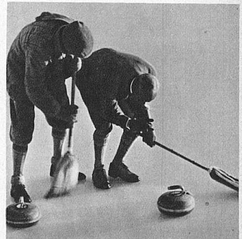
The curling fans — Die passionierten Curler