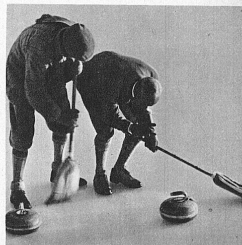
The curling fans — Die passionierten Curler