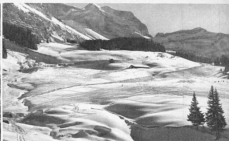
The ski-ing grounds at Wengen — Skifelder bei Wengen