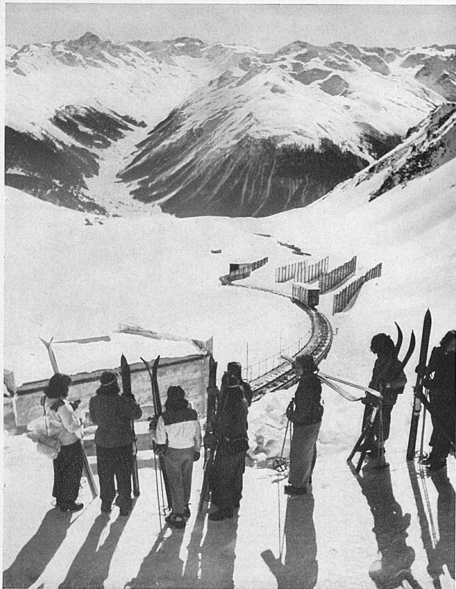
Left: The Parsenn, with its mountain railway and its long magnificent ski trails down to Davos and the Prätigau, is the skier's El Dorado. — Links: Die von einer leistungsfähigen Seilbahn erschlossene Parsenn, das Dorado der Skifahrer. Blick ins Döschmatal. — A gauche: La Parsenn, eldorado des skieurs, est accessible par un puissant funiculaire.