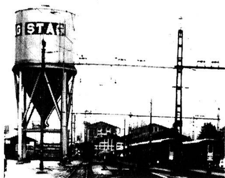
Cement Silo. Photo Editor.