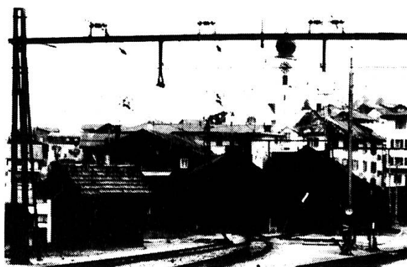
Locomotive sheds. Photo Editor.