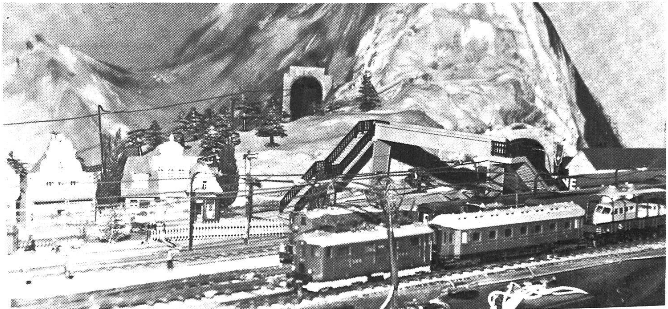
Cotine and tunnel entrance – Oberderbiggun.

An imaginary trip on the line will illustrate the character of the system and if ever you find yourself in the town of Rocesse, take a walk up the Rue de Remarque (rude remark) leaving the cathedral on your right and enter the terminus station. Here we can take a local stopping train to Cotine after admiring the international expresses drawn up under the train shed. We leave from Voie 4 passing the goods yard and loco depot, and thread the short tunnel under a spur of the alps, which brings us to the 1 in 50 climb through lush farming territory and past the Ozen industrial site. At the top of the climb we pass the church of St. Bingo who is a sincerely regarded character revered by many followers in Britain seeking financial blessing !