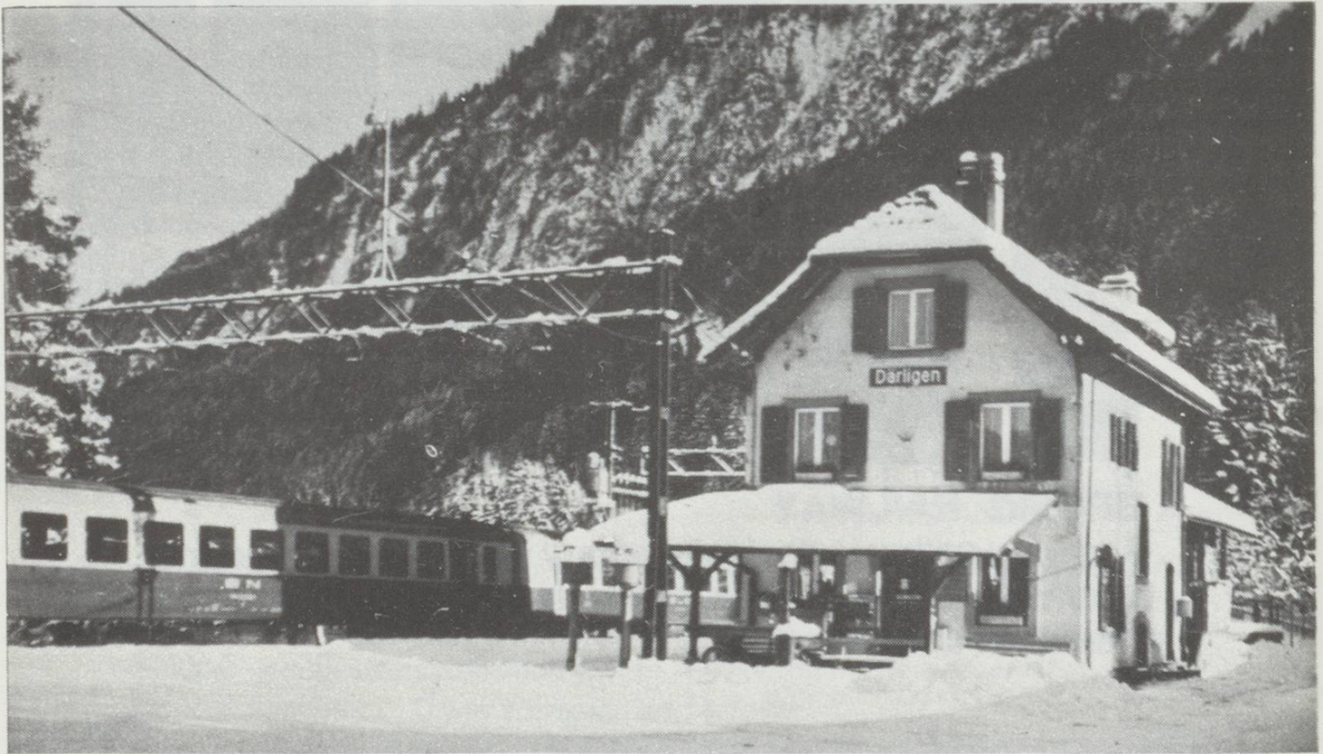
Station building at Darligen.

Trains bound for Interlaken use platform number 1 at Spiez. The route out of the station area is fairly straight, dropping from the main line which bears away on a sharp curve to the right. A recently built feeder station and a new under-line road bridge are so arranged to allow a second running line to be laid as far as the first stop at Faulensee. This is a pleasant little station with a loop and single siding (see rough layout plan). To judge by the film of rust on the rails, the loop does not see much use.