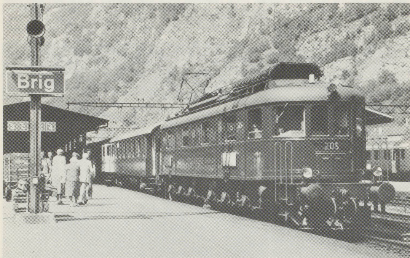
B.L.S. Ae6/8 No. 205 with Historic Coach Train. Brig station. B.L.S. 75 Years.

The next day, in glorious weather, I made my way from Interlaken to Bern to join the special train composed of 1930's stock hauled from Bern to Thun by S.B.B. locomotive Be4/4 No. 12320 in its brown livery. The locomotive trundled at its best speed to Thun where it was replaced by a B.L.S. Ae6/8 No. 205 built in 1939 to a 1926 design, which demonstrated its prowess with a seemingly effortless performance to surmount the north ramp to Kandersteg thence to drift down to Brig. I left the train there to have a look at the B.V.Z. at Visp and to attempt to photograph the train on its return journey to Hohten.