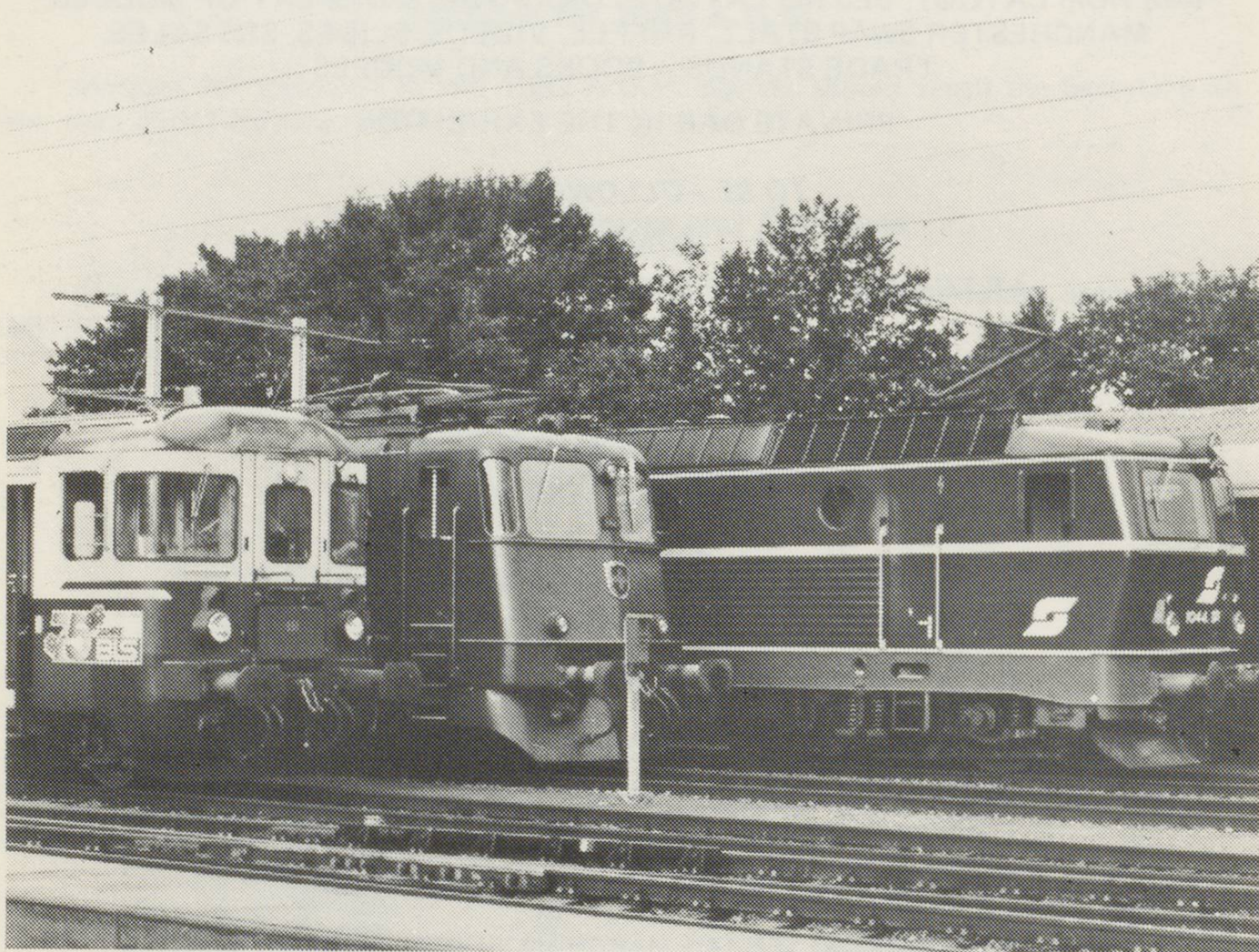
Visitors from near and far for B.L.S. 75.

To start with I will bore you with a bit of history. There had been a plan for an international railway through the Alps to Italy as long ago as 1857, but it was not until a concession for a line from Spiez to Visp was granted in 1891 that a serious attempt was made to breach the Lötschberg by rail. The concession was taken up in 1889 by the Canton of Bern and, with the help of French capital the Berner Alpenbahn, Bern-Lötschberg-Simplon Railway was constituted on 27 July 1896, two months after the opening of the Simplon Tunnel.