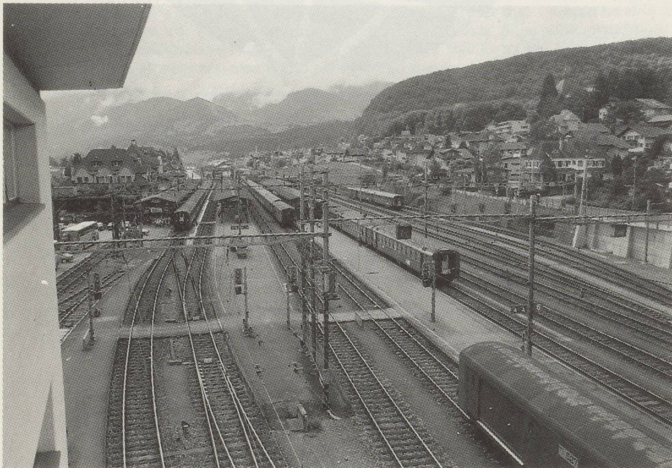
Spiez station from the signal tower.

The station has a regular interval timetable. The details in the accompanying table show a typical hour - at 10.30 a.m. and 12.03 p.m. trains leave for Frutigen and Zweisimmen simultaneously. Tracks 1 and 2 are used by trains to and from Interlaken respectively; Tracks 3 and 4 are used by trains to and from Brig and Italy as well as by Frutigen locals; and Tracks 5 and 6 are used by Zweisimmen trains. A wide variety of rolling stock passes through, including German and Italian sleeping cars as well as diverse examples of freight stock. If all goes well, we may soon see narrow gauge trains working through from the MOB at Montreux via Zweisimmen, Spiez and Interlaken and on up the Brünig line to Lucerne.