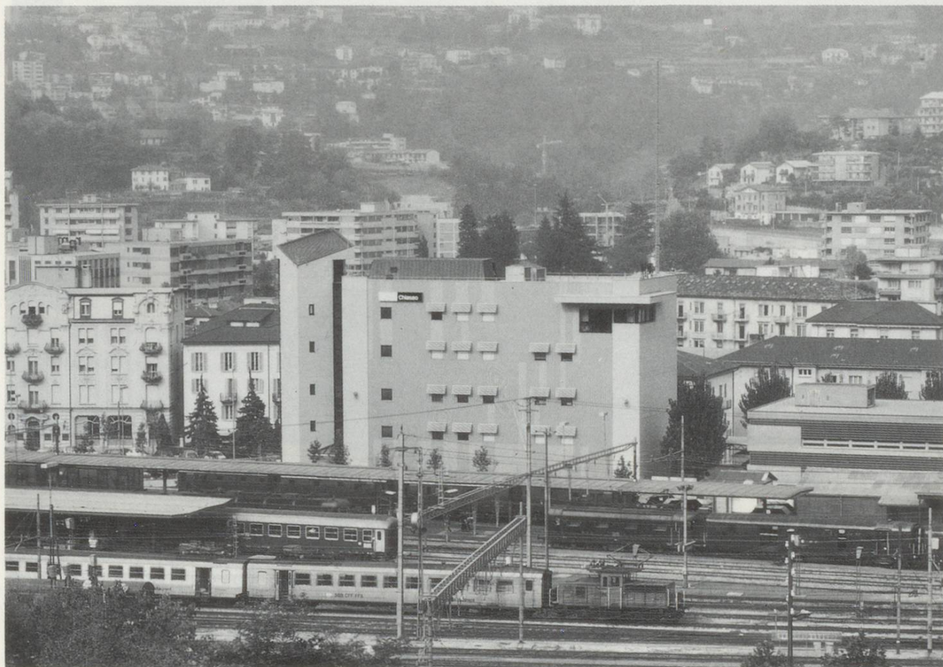
Chiasso Station and the new signal centre.

April 1989 saw another milestone in the modernisation of the Gotthard line of the Swiss Federal Railways, when the first fully computerised signalling system was commissioned. The new system was built and installed by Siemens Albis, to replace the 5 electro mechanical systems that had been working in this area since 1929. The core of the signal control system is the Siemens SIMIS-C micro computer - a miniaturised version of the SIMIS Control system - of which there are 69 controlling the 172 point motors, 303 track circuits, 377 signals, the SFR block system, the FS block system and two catenary power supplies located in the 100 kilometres of track within the Chiasso control area. This installation was the first full electronically interlocked system designed and built for the SFR.