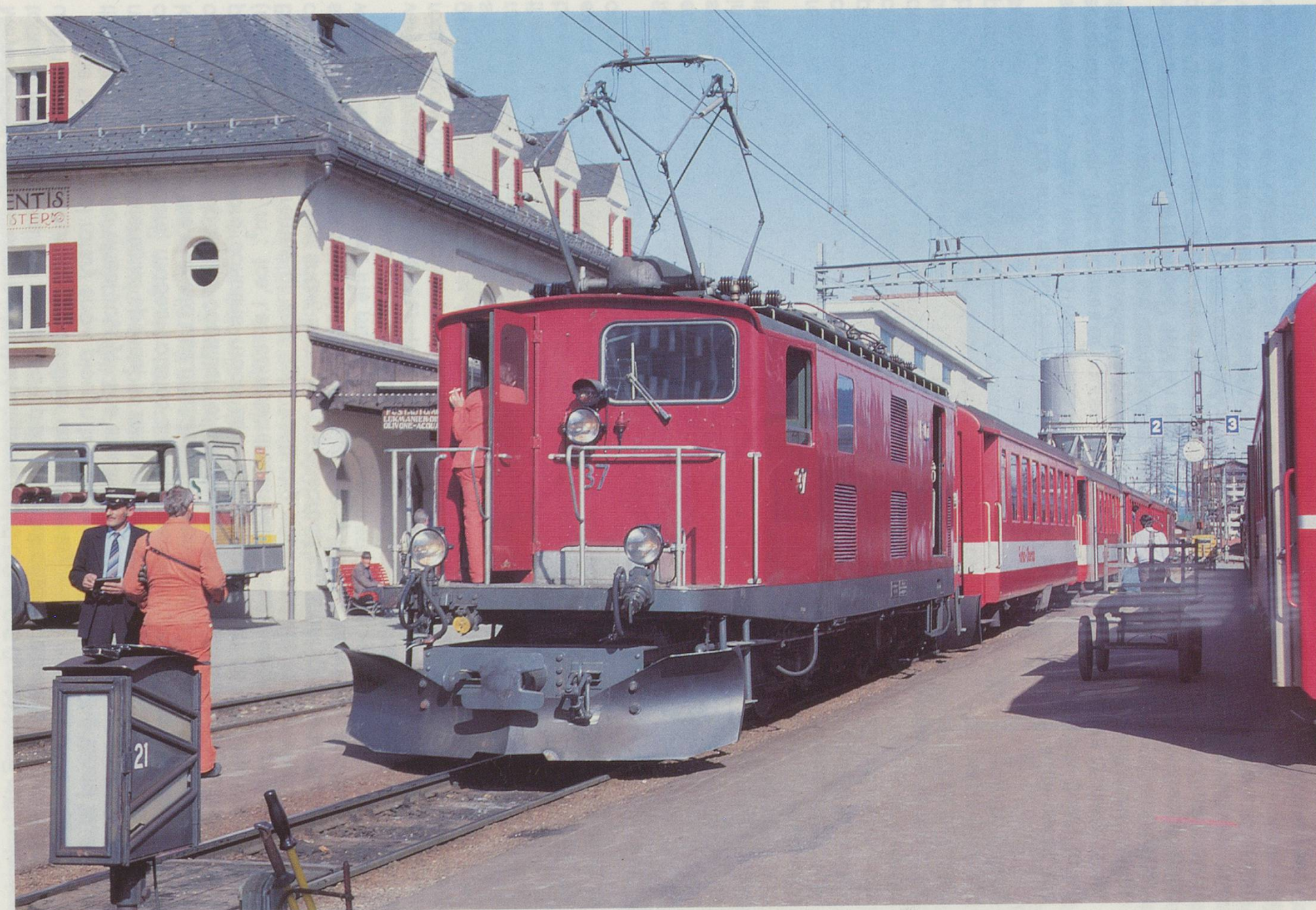
F.O. HGe4/4 No. 37 at Disentis with Glacier Express.