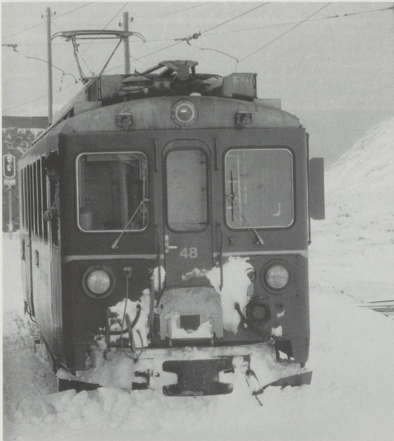
Rh.B. ABe4/4 No.48 battling the summer snow on the Bernina Line.

I may add that snow drifts and snow slides can pose considerable problems. Snow drifts on the Bernina Pass have attained depths of more than 7.5 metres. Snow slides usually carry with them stones, earth and timber which have to be removed before the rotary snow plough can be put to work. It often happens that once the line has been cleared, a second slide comes down at the same spot and the entire task has to be done again.