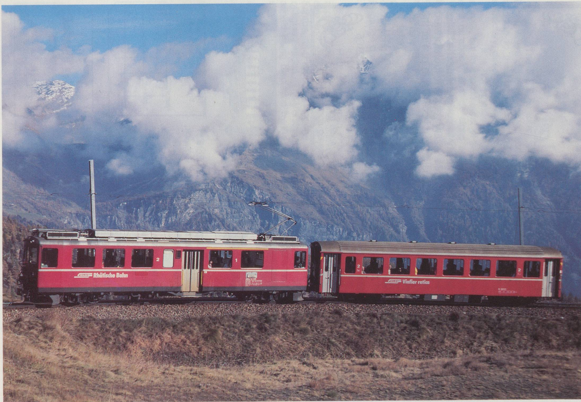
RhB. Triebwagen ABe4/4 No.48 approaching Alp Grüm on the Bernina Line.