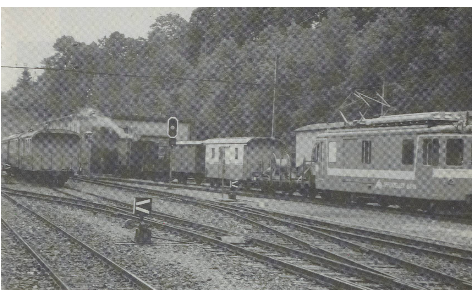
The Appenzellerbahn shed at Herisau, 2.6.90. De 4/4 No.50 with ex-RhB G3/4 raising steam.