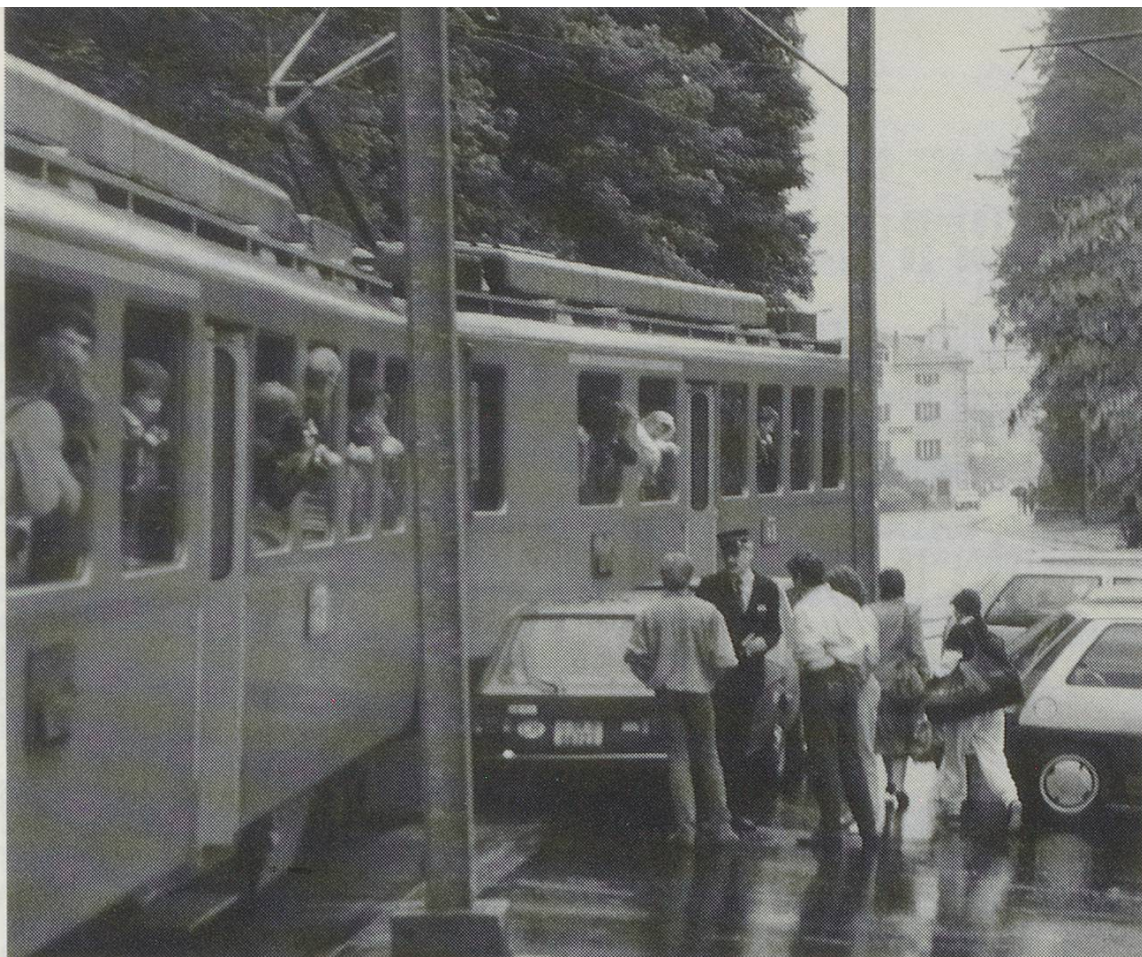
Contretemps near la Presse, 4.6.90. The Chur bound Bernina Express has just side-swiped two cars parked too close to the line.