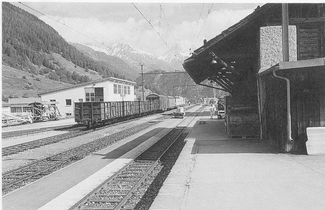
Zernez in June 1991, looking to the east. The shunter prepares a string of loaded and empty wagons for the mixed freight for Samedan.