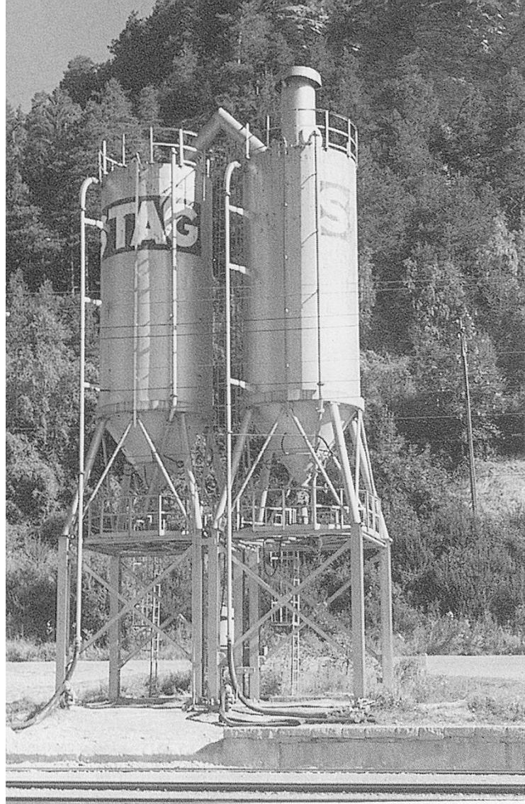
Cement silos at Tiefencastel in September 1978

and spot some lorries in strategic places alongside the sidings on one of our stations.