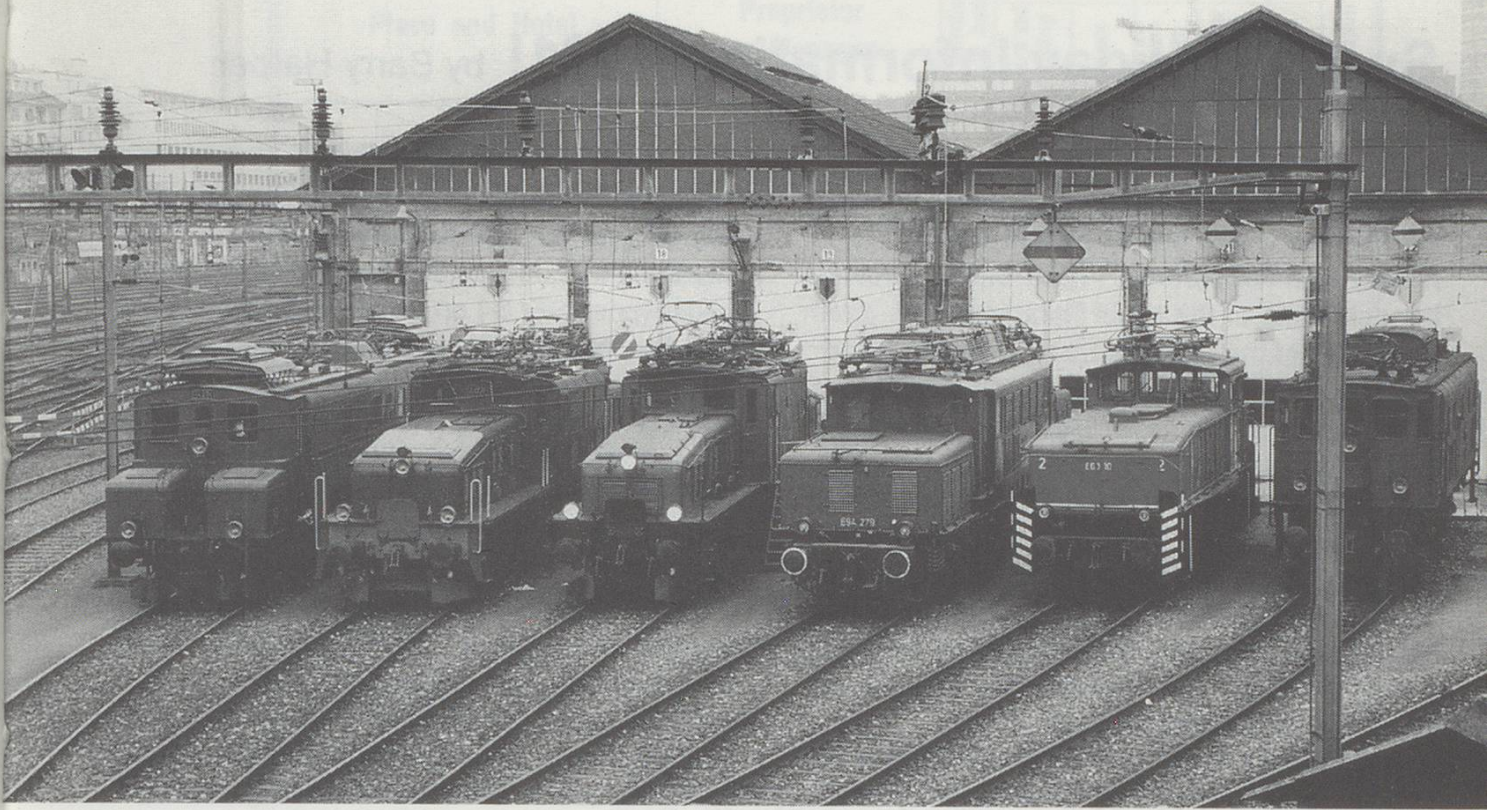
Above: Ce6/8 I 14201, Ce6/8 III 14305, Ce6/8 II 14253, E94 279, E60 10, Ae3/6 II 10439. in front of the Old depot. Opposite page: Eb2/4 5469 next to the Old depot 10/12/95 Below: Re460 019-3 with a CityNightLine coach, DB 103 238-2, Bm4/4 18435, in front of the New depot.