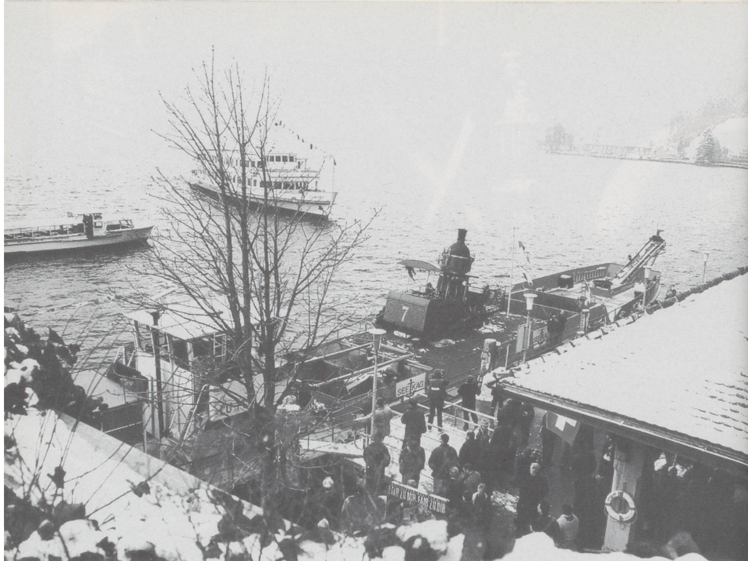
Above: No. 7 was delivered by boat from Luzern to Vitznau, where most of the village turned out to welcome the returning veteran.