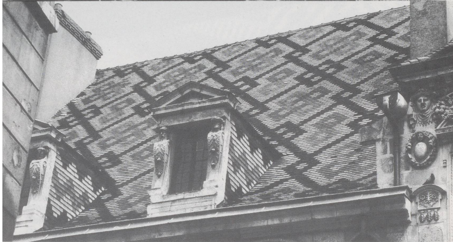
Opposite page: Dijon. One of the gas-turbine sets meets TER (local authority) train. This page: Top: Dijon. A real 'Oldie' CC 7122 on a modern intermodal container freight. Bottom: A Mosaic roof in Dijon.

ahead, you can get a special "Joker 30" price of CHF28 return from Vallorbe, or CHF 38 from Neuchatel (2nd class only), inclusive of TGV-Supplements! There is also a special excursion fare of CHF50 (2nd) and CHF60 (1st) from the border, including a city tour and free admission to museums (which are all closed on Tuesdays). This offer is available every day until 31st October 1996 bookable a few days before travel,